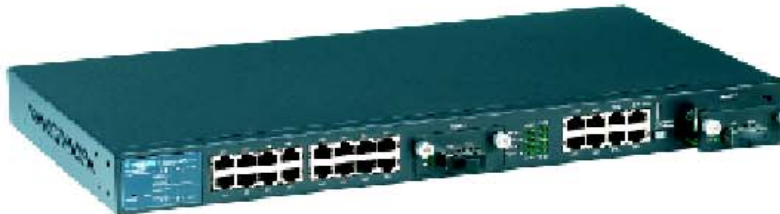
NetSpan-2222AF2 + FT860

NetSpan-2222A is developed based on 24 fixed TX ports. As other members of the NetSpan-2000 line, NetSpan-2222AF2/2222A supports several management functions ranging from port-based VLAN and security to QoS for priority queuing. With the aid of these advanced technologies, NetSpan 2222AF2/2222A is definitely the savior to network managers!